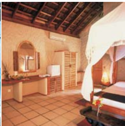
Sunrise Cottage Bath