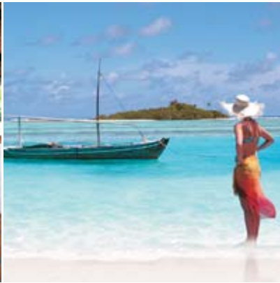
Ocean View Villa