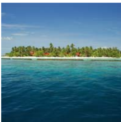
Deluxe Bungalow Exterior