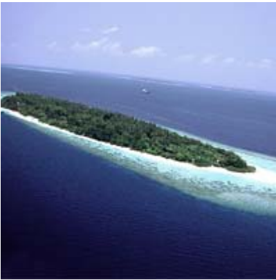
Royal Room Exterior